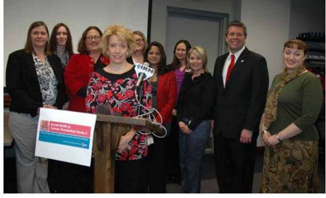
Representatives of the Illinois Coalition of Community Blood Centers, Illinois legislators, and the American Cancer Society join together at a press conference to raise awareness of the importance of volunteer platelet donors for cancer patients undergoing treatment.

blood centers, all of whom are America's Blood Centers members. During a press conference held about a week ago at the Capitol, Illinois blood centers and the American Cancer Society explained the important role that platelet donors play in a cancer patient's recovery, as many patients require platelet transfusions during chemotherapy treatments. "When a patient undergoes chemotherapy or radiotherapy to treat cancer such as leukemia, that treatment can suppress the patient's bone marrow where blood cells are produced. Until the bone marrow recovers, the patient will be at risk of severe bleeding due to a lack of platelets, which are responsible for blood clotting in the bloodstream. The recovery period may take several weeks," explained Meghna Desai, MD, who practices as a hematol-